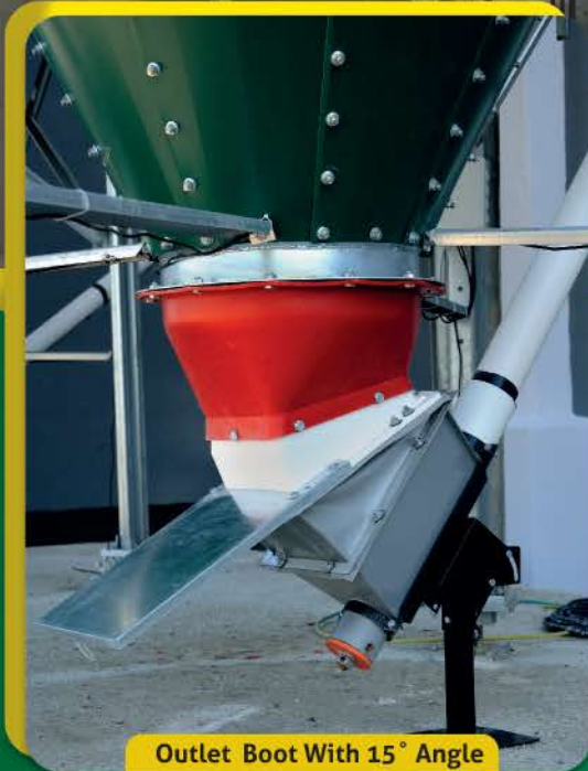
Outlet Boot With 15° Angle